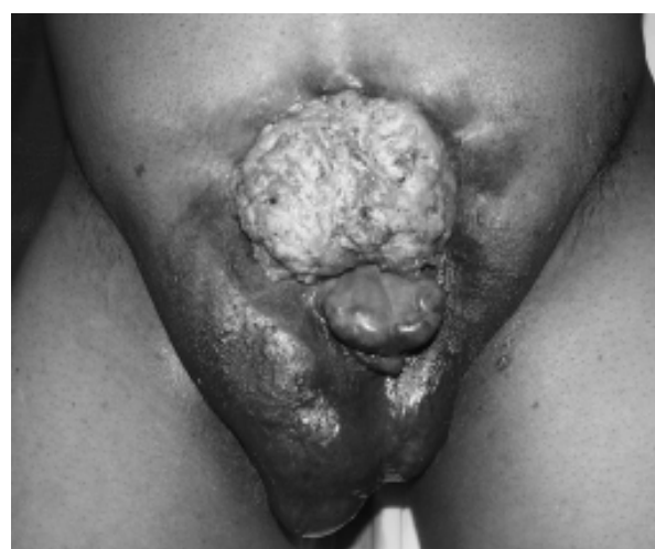
Fig 1: pre-operative photograph showing tumour

exstrophied bladder, progressive in nature about 1-year prior to the presentation (fig. 1); It had started bleeding at the time of presentation.