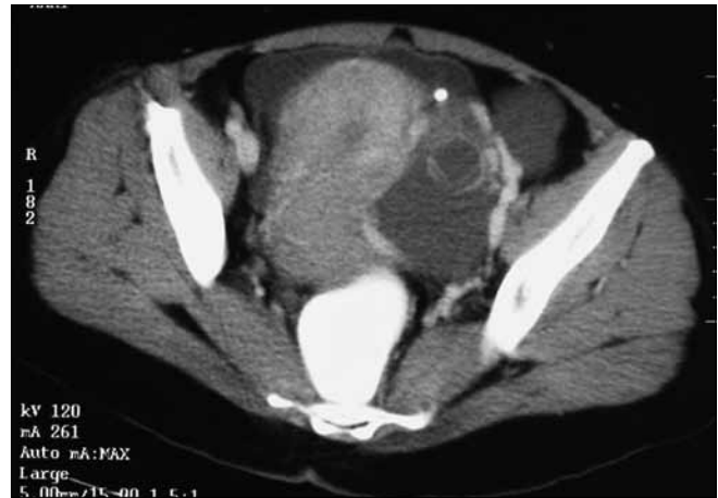
Figure 1: Contrast-enhanced CT scan showing tumor with increased vascularity in the periphery

Fallopian tube carcinoma is often preoperatively misdiagnosed as ovarian carcinoma. Accurate diagnosis and differentiation of PFTC from lesions that have spread from the ipsilateral ovary by direct extension or from the contralateral ovary by trans-coelomic route are important for monitoring trends in incidence, for better characterization of prognostic