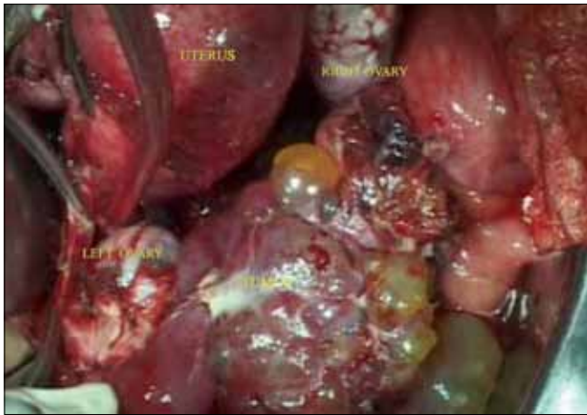
Figure 2: Mass arising from the left fallopian tube. Both ovaries appear free of disease