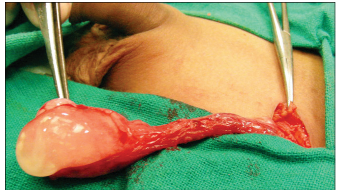
Figure 2: Gelatinous material with yellowish-white flakes on incising the testis