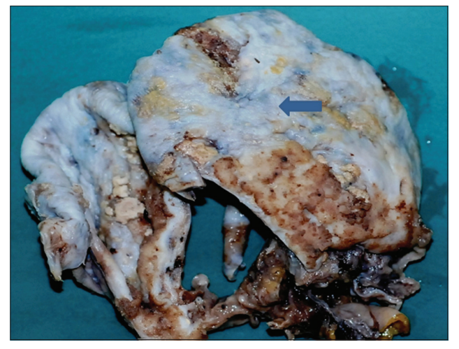
Figure 1: Gross photograph of the inner surface of the cystic ovarian tumor shows brownish-white papillary excrescences of the tumor along with extensive pearly-white glistening areas indicating metaplastic squamous epithelium (arrow)

([Figure 2c], inset). Focally, both the squamous morules and keratin plaques showed preserved nuclei (arrow), nuclear ghosts and intercellular bridges [Figure 2d]. In addition, areas of stromal tumor infiltration and extensive stromal hyalinization were also evident. Peritoneal cytology