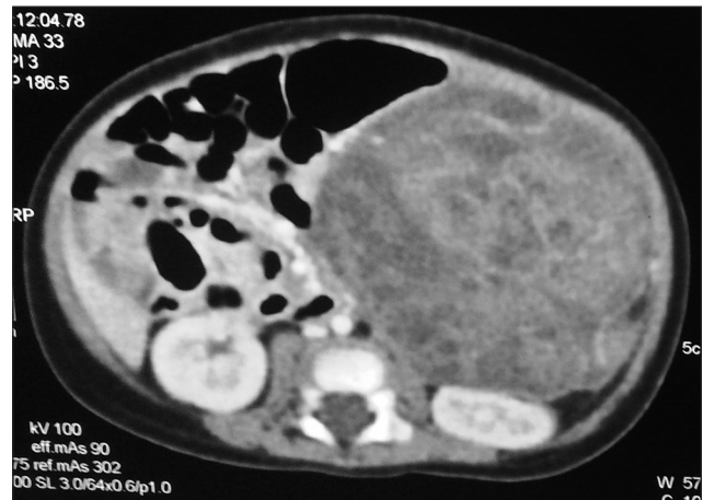
Figure 1: Axial contrast enhanced computed tomography of abdomen showing a large heterogeneous mass pushing the left kidney inferiorly and displacing the gut, no evidence of calcification