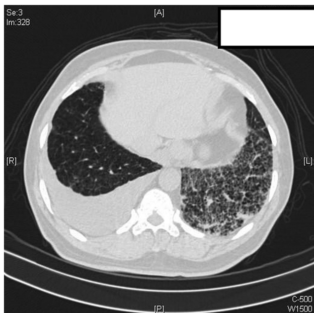
Fig. 1 High-resolution chest CT scan: interlobular septal thickening and ground-glass opacities in the left lower lobe along with right-sided pleural effusion on a background of centrilobular emphysema.

We report a case of concomitant and contralateral pleuro-pulmonary toxicity (ILD and pleural effusion) due to Dasatinib at 30 months after drug initiation.