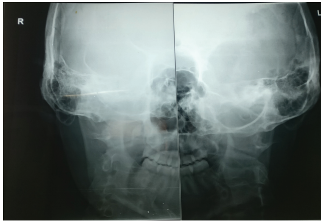
Supplementary Fig. 1 X-ray pelvis with bilateral hip joints AP view without any changes of arthritis.