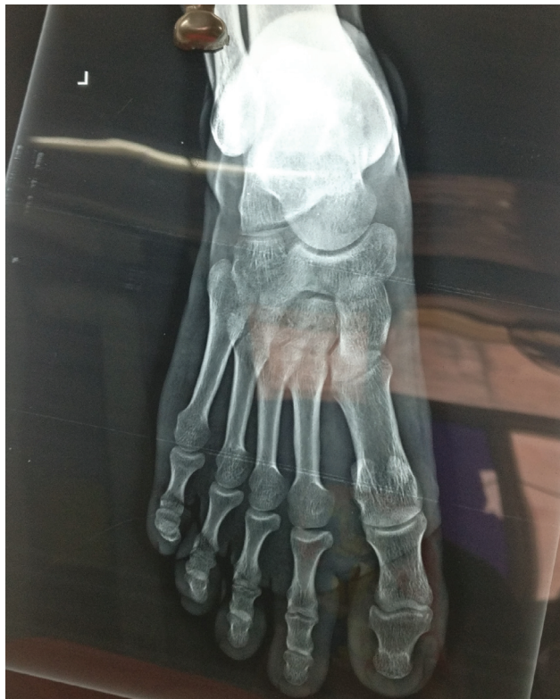
Supplementary Fig. 3 RT-PCR for PML-RAR? positive for BCR1 transcript.