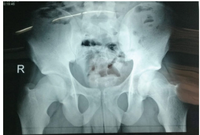
Supplementary Fig. 2 X-ray left foot AP view with no significant abnormality.