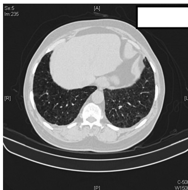
Fig. 3 High-resolution chest CT scan: significant clearing of left lower lobe interlobular septal thickening and ground-glass opacities with minimal residual right pleural thickening. Centrilobular emphysema is well appreciated here.

Common hematological side effects of Dasatinib include myelosuppression with neutropenia and thrombocytopenia. 6 The significant cardiothoracic adverse effects are pleural and pericardial effusions. 7 Other side effects like pulmonary hypertension, alveolar hemorrhage, and ILD are rare in literature 3–5,8 with most studies reporting an incidence of pleural effusion at 23 to 35% (► Table 1 ). Summary of important studies of Dasatinib-induced pleural effusion is described in ► Table 1 .